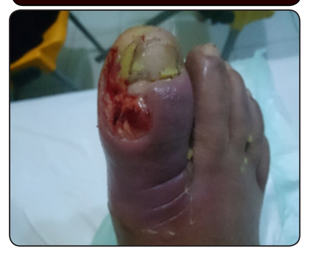
Figure 4: The Patients Foot Picture after Treatment in May 2015

Figure 1: The Patients Foot Picture before Treatment in March 2015