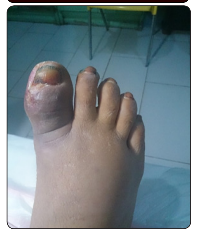
Figure 2 & 3: The Patients Foot Pictures During Treatment in April 2015

Figure 4: The Patients Foot Picture after Treatment in May 2015