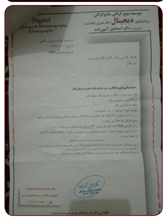
Figure 1: Biometric Ultrasound at the 30<sup>th</sup> Week of Pregnancy